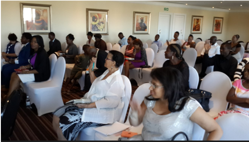
One of the Sessions from the Conference